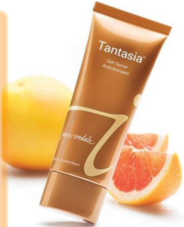
Sun-kissed. Tantiasia™ from jane iredale

Ready for a Spring Time glow? Tint today, tan tomorrow with Tantiasia self-tanner and bronzer by jane iredale! A unique blend of ingredients work with your skin to gradually develop a customized, even, natural looking tan! The delicate citrus scent is uplifting and has none of the unpleasant after-smell often associated with self-tanners! $36 -will tan your entire body approximately six plus times depending on body size-- Featured January and February in Allure magazine, American Spa, New Beauty, and Web MD. Purchase now and receive a free Just Kissed Lip & Cheek Stain Sample!